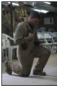
Servicemembers with Marine Medium Helicopter Squadron 364 gathered at the Al Taqaddum Mainside Chapel to remember six of their fellow 'Purple Foxes', Feb. 11. The four Marines and two corpsmen gave their lives in support of Operation Iraqi Freedom during casualty evacuation operations outside of Fallujah, Feb. 7.